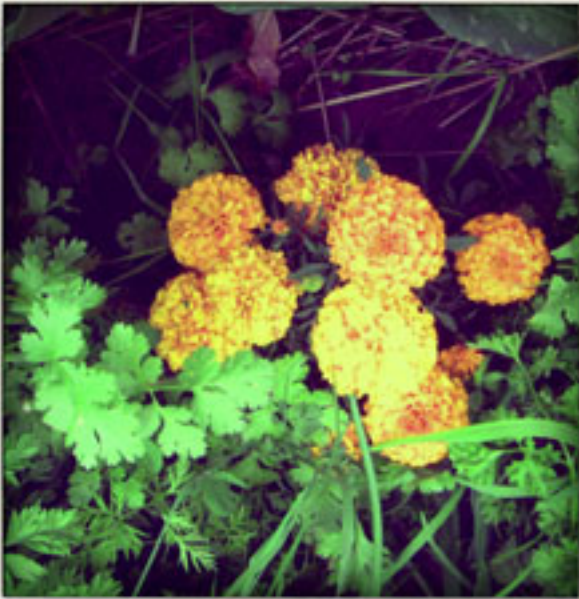
The Garden Garnish